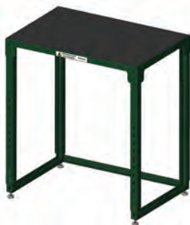
Adjustable Utility Stand, shown at 60, 50 and 40 inches.

36" W x 24" D x 50" H Part Number 160050 Retail Price $1,067